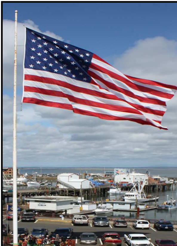
The former Flagpole with Flag flying proudly