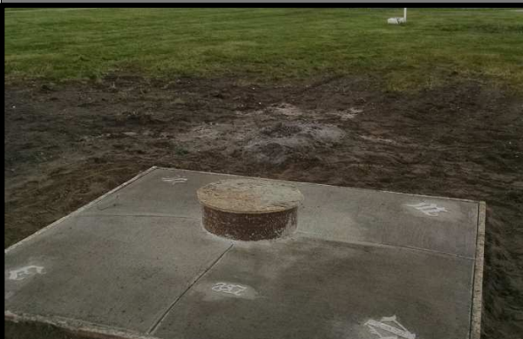
New compass rose Flagpole base 2017

All are encouraged to attend the Ceremonial RE-dedication this July 4th, 2017 at 10:00 AM on the Museum Grounds.