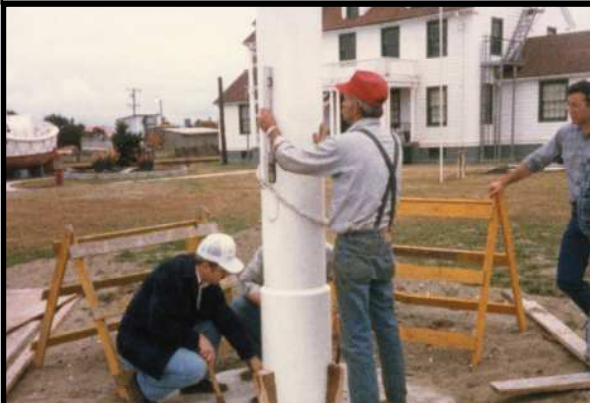
Original Installation of Flagpole in 1987